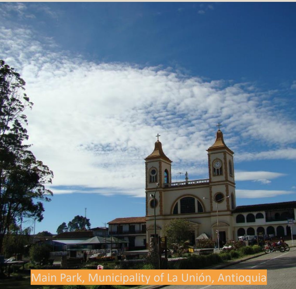
Main Park, Municipality of La Unión, Antioquia