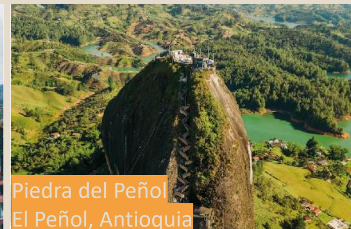
Piedra del Peñol El Peñol, Antioquia