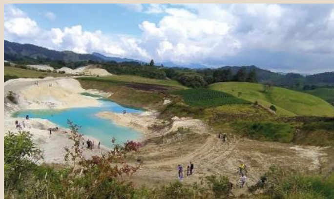
Kaolin mines - La Laguna Azul - La Unión, Antioquia